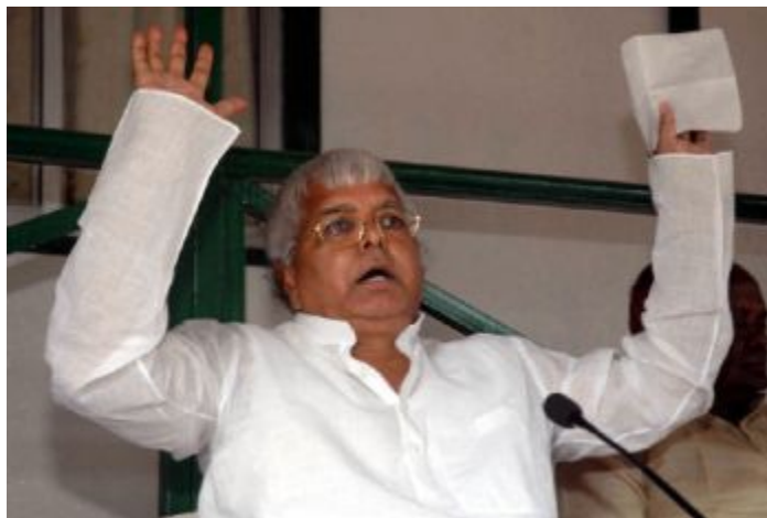
Railway Minister Lalu Prasad addressing a press conference in Patna on Sunday.

Patna: Railway Minister Lalu Prasad on Sunday urged all MPs and lawmakers belonging to all parties from Bihar to resign after November 15 to protest against attacks on north Indians, particularly Biharis, in Maharashtra.