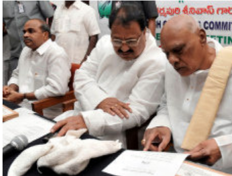
Gearing up: Chief Minister Y. S. Rajasekhara Reddy, APCC president D. Srinivas and Finance Minister K. Rosaiah at the PCC office bearers meeting in Hyderabad on Sunday.

HYDERABAD: Chief Minister Y. S. Rajasekhara Reddy described Praja Rajyam president Chiranjeevi as a “political novice” who lacked a clear understanding of various issues.