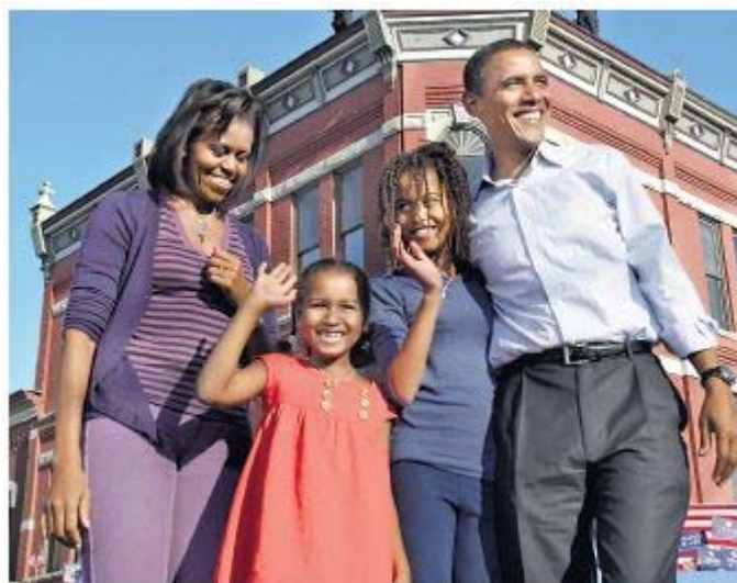
ALL SMILES: U.S. presidential candidate Senator Barack Obama at a rally with wife Michelle Obama and daughters Malia and Sasha, in Pueblo, Colorado, on Saturday.

WASHINGTON: In the U.S. presidential contest's final frenzied weekend, Senator Barack Obama promised to heal America's political divisions while rival John McCain fought to hold on to Republican States and pledged to score a historic upset.