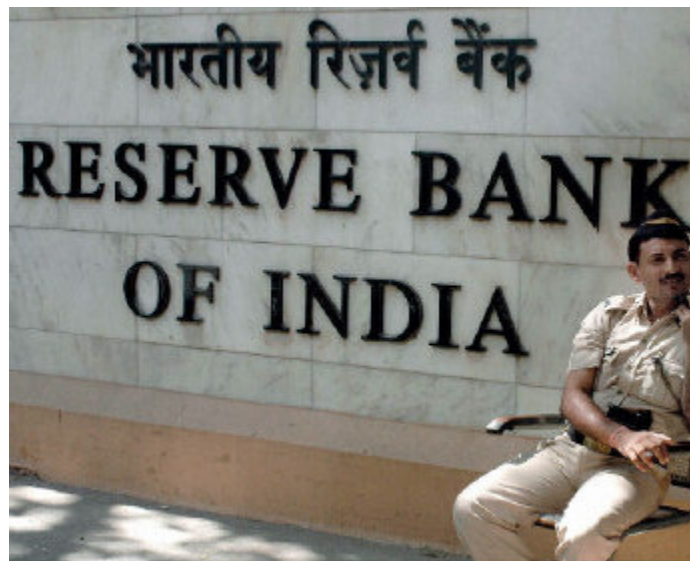
GUARDING: A security person at the Reserve Bank of India headquarters in Mumbai during the announcement of credit policy last week.

It is not an exaggeration to say that the recent Reserve Bank of India’s monetary policy statement — the Mid-Term Review of the Annual Policy — was hijacked by the extraordinary circumstances under which it was presented. As the new RBI Governor D. Subbarao put it, the review is set in the context of several complex and compelling policy challenges. The global financial system is amidst a crisis of unprecedented dimensions.