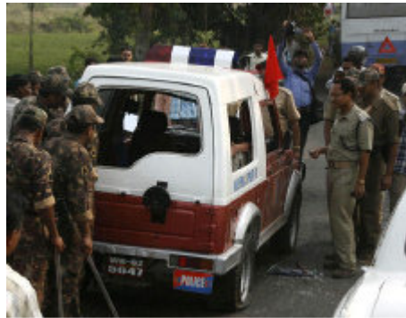
Caught in blast: The pilot vehicle, that was part of the convoy of Union Steel Minister Ram Vilas Paswan, which was damaged in an IED blast at Salboni in West Midnapur on Sunday.

KOLKATA: West Bengal Chief Minister Buddhadeb Bhattacharjee and Union Steel Minister Ram Vilas Pawan had a narrow escape when a powerful improvised explosive device went off moments after their convoys passed through Kalaichandi in Paschim Medinipur district on Sunday. The blast damaged a pilot vehicle.